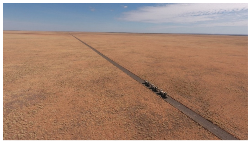
Photo 1 - Barkly Tablelands - Northern Territory

New datasets provided by Geoscience Australia ("GA") as part of the Exploring for the Future Program provide crucial new data to open up and facilitate exploration in this covered, highly prospective and underexplored region of Australia (Photo 1).